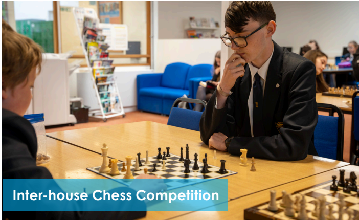
Inter-house Chess Competition